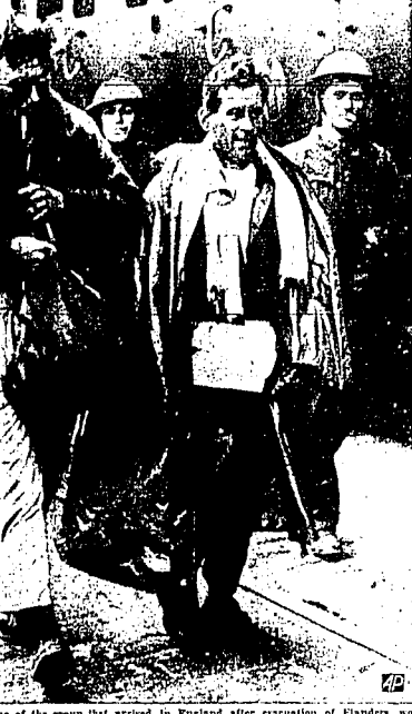
BRITISH SOLDIER at left, one of the group that arrived in England after evacuation of Flanders...