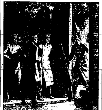
"An amusing scene lay them in"