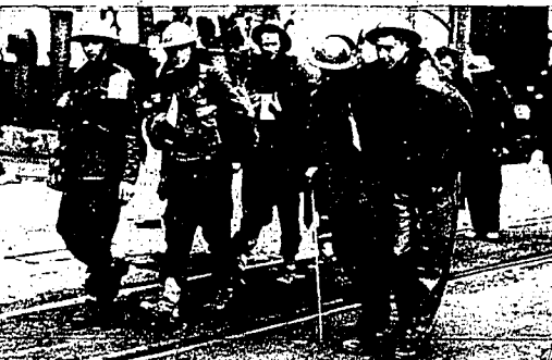
THIS PICTURE shows men of the British expeditionary force as they arrived at a British port after their escape from the German sweep through Flanders. One soldier assisted a wounded comrade who walked with the aid of a stick.

domestic policy, and a demand on foreign policy, after a week or more about matters at home and right about issues abroad.