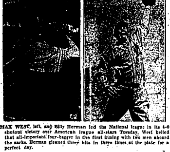
MAX WEST, left, and Billy Herman led the National League in its 4-0 shutout victory over American League all-stars Tuesday.