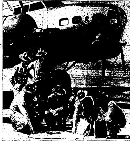
TO INSURE an adequate supply of pilots and navigators for its huge four-motored Boeing B-17-B bombers, the army air corps is completing their training at March field, herebefore solely a tactical base and repair depot. Left, Patrick McIntire (pointing) demonstrates a navigation problem before taking off in the B-17-B bomber in the background. Each student carries a case of navigation instruments.