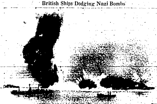
THIS UNUSUAL AERIAL PHOTOGRAPH, according to British sources, shows an aerial attack on British-occupied vessels by German planes in the English channel...