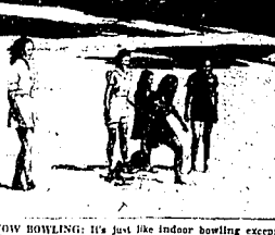
SNOW BOWLING: It's just like indoor bowling except that this player gets only one ball, each roll in the snow.