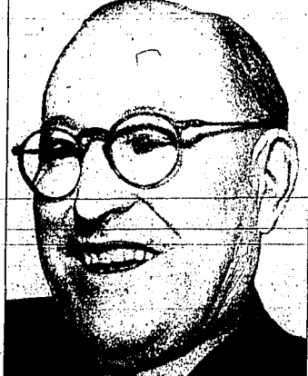
UNITED STATES SENATOR JOHN THOMAS, in Idaho's Republican race ahead of his opponents for the unexpired term of the late Senator William E. Borah.