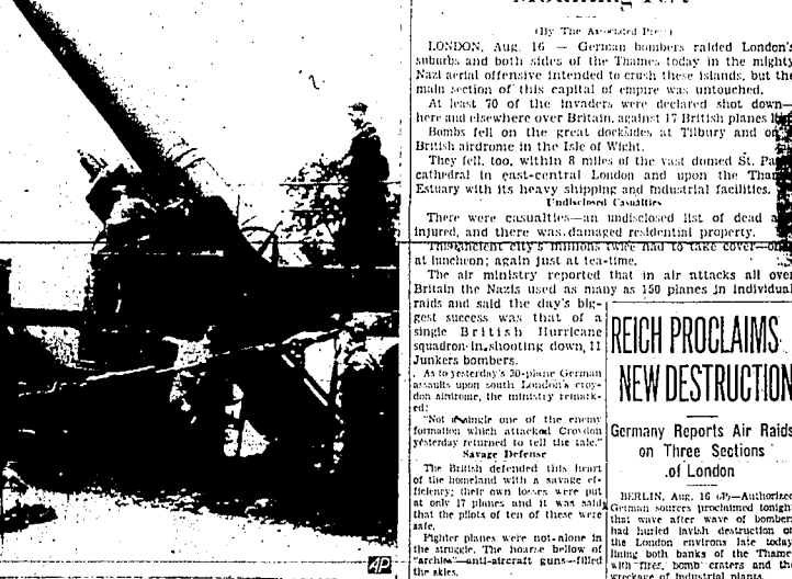
PRIME MINISTER WINSTON CHURCHILL, in a tour of British defenses against the threatened German invasion, which observers thought imminent, talks at an antiaircraft post to watch a gun crew handle a 24-inch railway cannon.