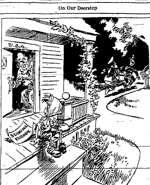
On Our Doorstep