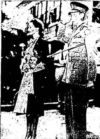
WINDSORs turned out to welcome the Duke of Windsor, new governor of the Bahamas, and his duchess. They are shown here as they started for the legislative council chambers at Nassau, Bahamas, where the duke took the oath of office.