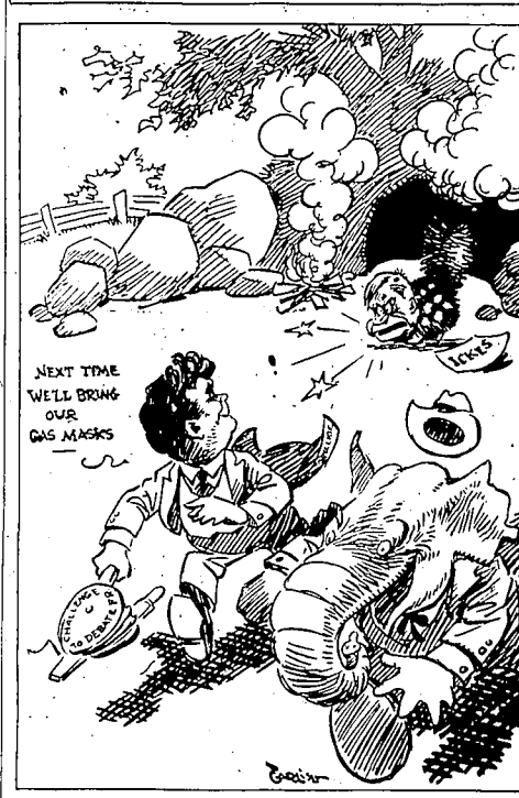
Next time we'll bring our gas masks.