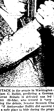
Portrait of a man, likely a senator or politician mentioned in the article.

Replicators Lead Complete, unofficial returns for the three candidates and 52,700 for the seven Republican candidates.