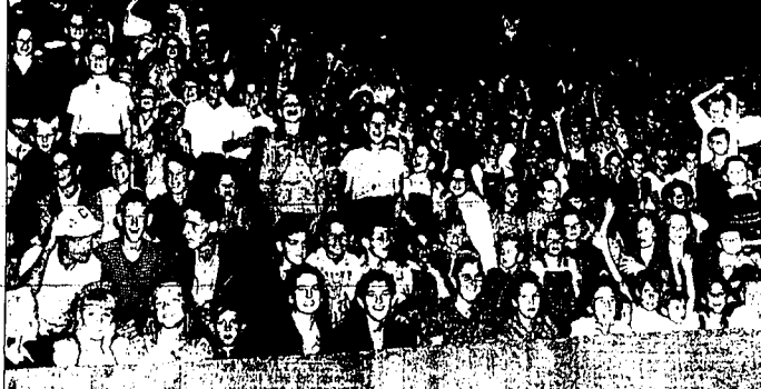
ONLY A FORTION of an estimated crowd of 600 children attending the Cowboy-Busset game last night are shown in this picture. The youngsters were given the Twin Falls baseball ball and the merchandise bureau of the Chamber of Commerce as the closing event of the first annual "Wild Day" here yesterday. Perhaps this wild party cheering section didn't have anything to do with it, but the Twin Falls Cowboys scored a 7 to 2 victory over Idaho Falls. Three baseballs autographed by every member of the Cowboy squad were given away to children in this mob. (News Photo and Engraving.)

LANDIS HITS INTIMIDATION OF UMPIRES Lewiston Team Triumphs, 8-3 New Yorkers Defeat Cleveland Indians, 5 to 3 LEWISTON, Mont., Aug. 23 (AP) —The Lewiston team triumphed over the New York Yankees in a 5-3 victory over the league-leading Cleveland Indians today, the Yankees' fifth straight triumph over the American league's top team.