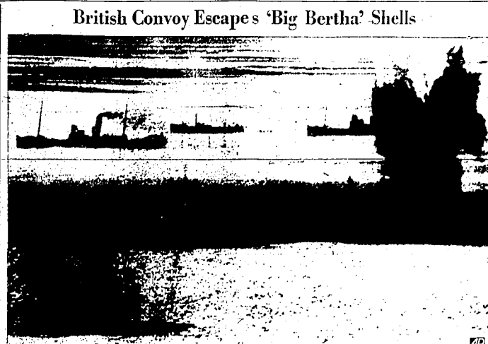
THIS DRAMATIC CALLERPHOTO, sent from London to New York, shows part of the mile-long, British convoy which was bombarded by big German guns on the shore of France. The convoy was steaming up the English channel, according to the British-approved caption. Two shells have just fallen near the ships. The black streak is part of the original picture, but was not explained. The Germans said it was "only practice shooting."