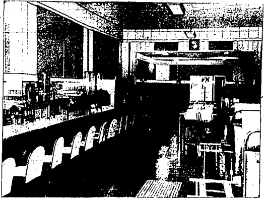
REMODELED at a cost of $15,000 following a recent fire, the Blue Arrow cafe is now ready for tonight's grand opening, according to Charles F. Smith, proprietor. The modernistic interior of the cafe is shown here, and the extension at the rear to provide a banquet room may also be seen.