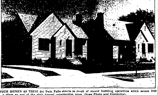
SUCH HOMES AS THESE AT Twin Falls streets as result of recent building operations which assure 1940 a place as one of the city's biggest construction years.