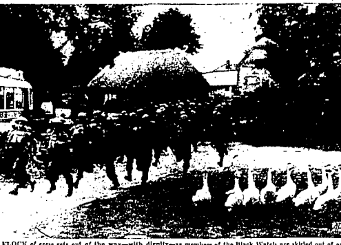
A FLOCK of crew gets out of the way—with dignity—as members of the Black Watch are skirted out of quarters in answer to a practice alarm on England's South coast. The pipe's by the fere. The Watch, fought with the H.E.F. in Belgium. Now, back in England, it's on duty to mop up any parachute invaders who drop in.